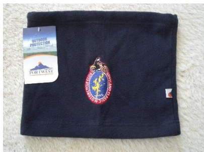
Fleece snood: £8.00