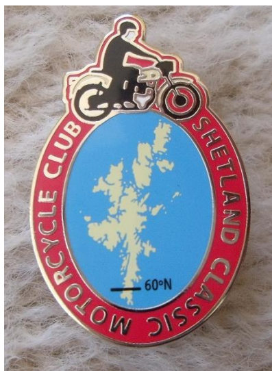
Metal pin badge: £3.00