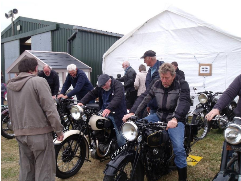
Getting ready for the "off" at Da Waas Vintage Day 2015