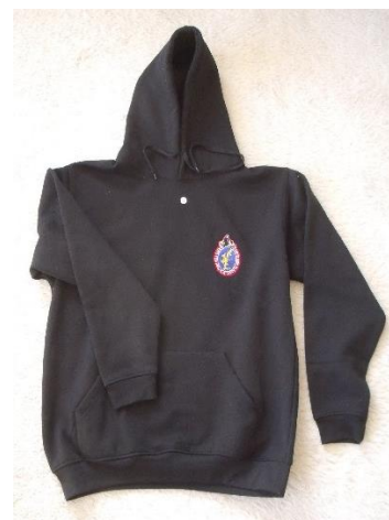
Hooded sweatshirt, various sizes and colours: £18.00

For regalia please contact Russell Black : 01950 431495