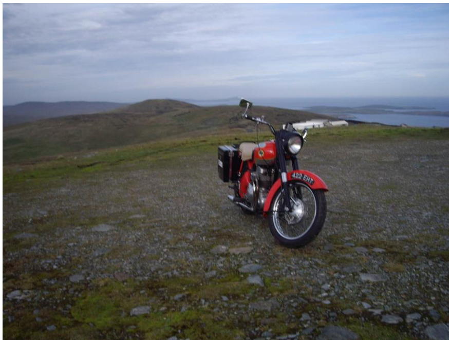
On top of one of the tops on the Mossy Hill

From Noss Hill I was looking north-east to the Ward of Scousburgh (Mossy Hill). I decided that would be my next stop. I went up the Mossy Hill from the west side of Shetland, going up by Vanlop to get to the top at 263m, great views again, there are quite a few side roads on the tops as the Mossy Hill was used by the M.O.D. as part of a radio network in Shetland including Collafirth in the North Mainland, Saxavord on the isle of Unst and Maybury station at Sumburgh on the South Mainland. This was in turn part of a greater communication system called ACE HIGH for N.A.T.O. during the cold war of the 1950's. If you want great views including St Ninian's tombolo, Foula to the West, Bressay to the East and Sumburgh in the South, it is quite accessible, being tarred all the way up. I came back down the east side, quite steep, onto the main A970 near Levenwick and my road home.