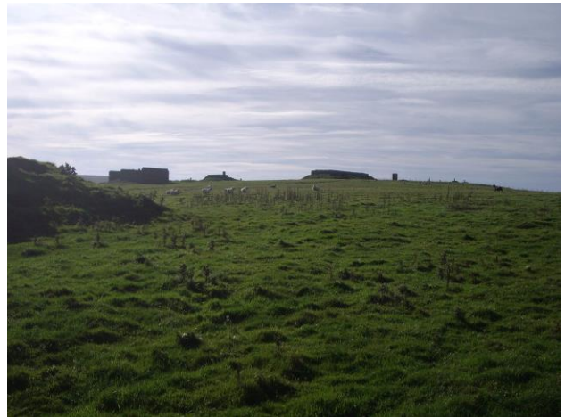
Some of the buildings

From Noss Hill I was looking north-east to the Ward of Scousburgh (Mossy Hill). I decided that would be my next stop. I went up the Mossy Hill from the west side of Shetland, going up by Vanlop to get to the top at 263m, great views again, there are quite a few side roads on the tops as the Mossy Hill was used by the M.O.D. as part of a radio network in Shetland including Collafirth in the North Mainland, Saxavord on the isle of Unst and Maybury station at Sumburgh on the South Mainland. This was in turn part of a greater communication system called ACE HIGH for N.A.T.O. during the cold war of the 1950's. If you want great views including St Ninian's tombolo, Foula to the West, Bressay to the East and Sumburgh in the South, it is quite accessible, being tarred all the way up. I came back down the east side, quite steep, onto the main A970 near Levenwick and my road home.