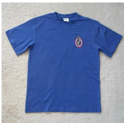
T-shirt, various sizes and colours: £10.00