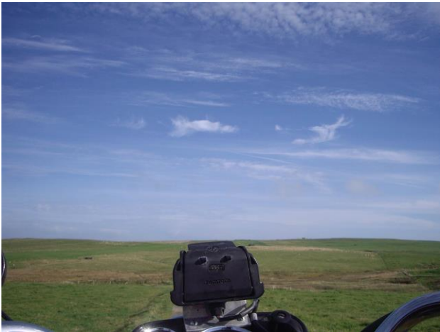
A view from the saddle