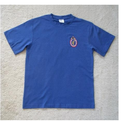
T-shirt, various sizes and colours: £10.00