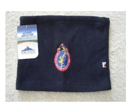
Fleece snood: £8.00