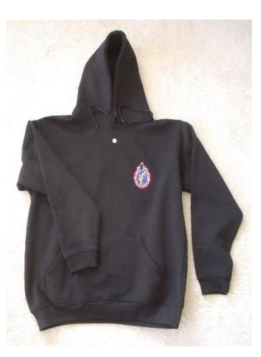
Hooded sweatshirt, various sizes and colours: £18.00

Sweatshirts without hoods now also available in various colours. For regalia please contact Russell Black: 01950 431495.